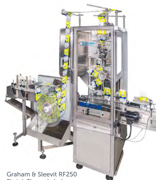
Graham & Sleeveit RF250 Shrink Sleeve Labeler