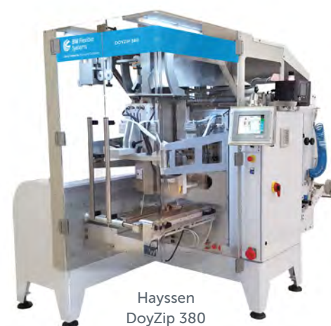
Hayssen DoyZip 380